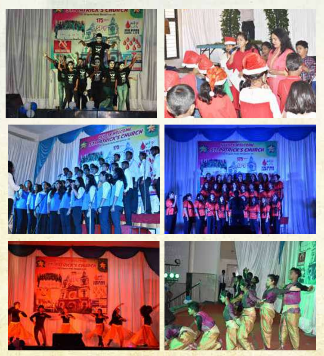
Patrick's Church is indeed in very good hands... at least for the next 175 years!

It was definitely an evening to be remembered and the St. Patrick's Youth proved yet again that the future of St.